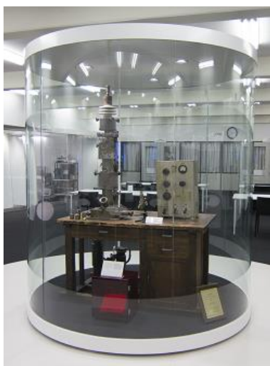
(1) Transmission Electron Microscope DA-1